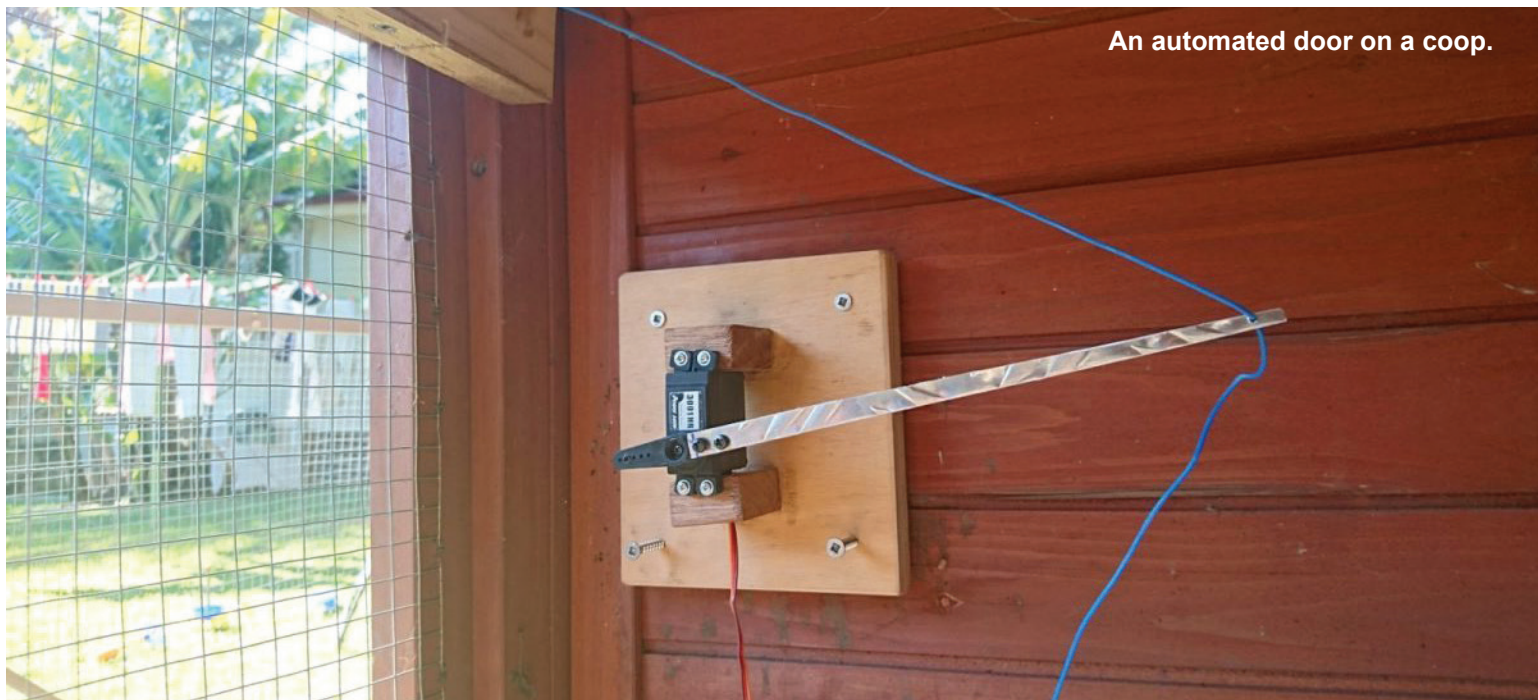
An automated door on a coop.