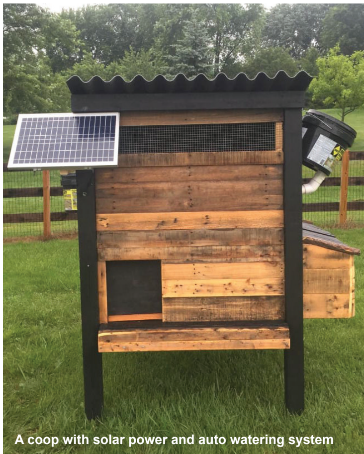
A coop with solar power and auto watering system

Installing a thermostat and ventilation system for the chickens will save time and money. Also, keeping the moisture in the coop to a minimum helps bedding last longer and keeps chickens healthier. The thermostat monitors the changing weather and keeps the inside cozy for the chickens to maintain optimal laying conditions. To keep a closer eye on the chickens, install a wireless camera that can broadcast to a smartphone or computer. This can also be used to see which chickens are producing the most.